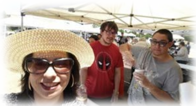
Feeding the Homeless on the First Saturday of every month at 11:30am

looked like. I was shown and sent pictures of the beautiful blue hibiscus like the one in my yard and various rose bushes. The daughters were thrilled to finally hear the heart-warming story of the rose of Sharon from the Song of Solomon.