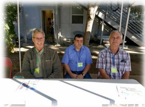
Prayer Table of St Francis Church at the Love Stockton Event at the Gospel Rescue Mission.