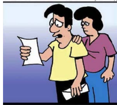
"Its from our church... we've been called up for active duty."

As we pray each Sunday: Yours, O Lord, is the greatness, and the power, and the glory, and the victory, and the majesty: for everything in heaven and on earth is yours; yours is the Kingdom, O Lord, and you are exalted as Head above all. All things come from you, O Lord, and of your own have