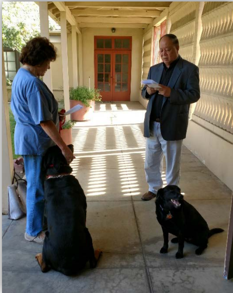
St Francis Animal Blessing With Oxley and Abbey