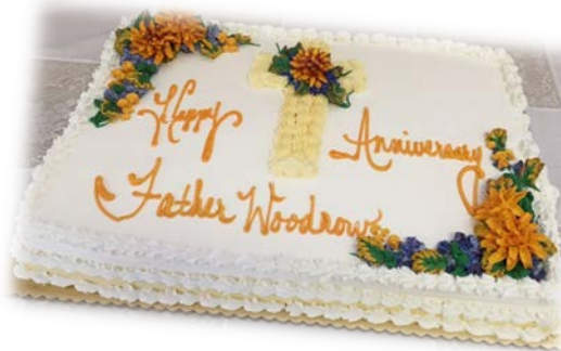
Happy 45 th Anniversary of your priesthood Fr Woodrow Gubuan