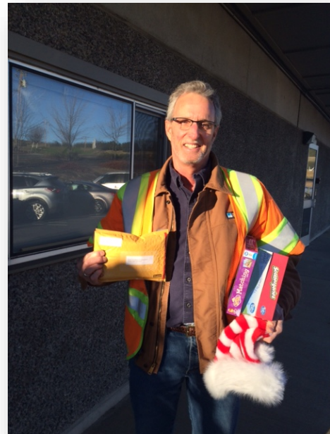
Butte Fire Victim Delivery of Gift Cards from St Francis of Assisi and other gifts for the children for Christmas.

Diocesan Newsletter: http://www.dioceseofsanjoaquin.net/san-joaquin-anglican.html