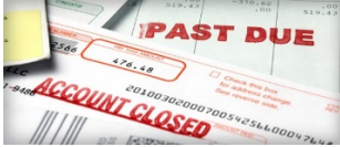
Dave Ramsey Financial Peace