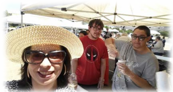
Feeding the Homeless on the First Saturday of every month at 11:30am