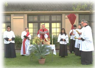
Palm Sunday at St Francis