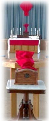
Good Friday at St Francis